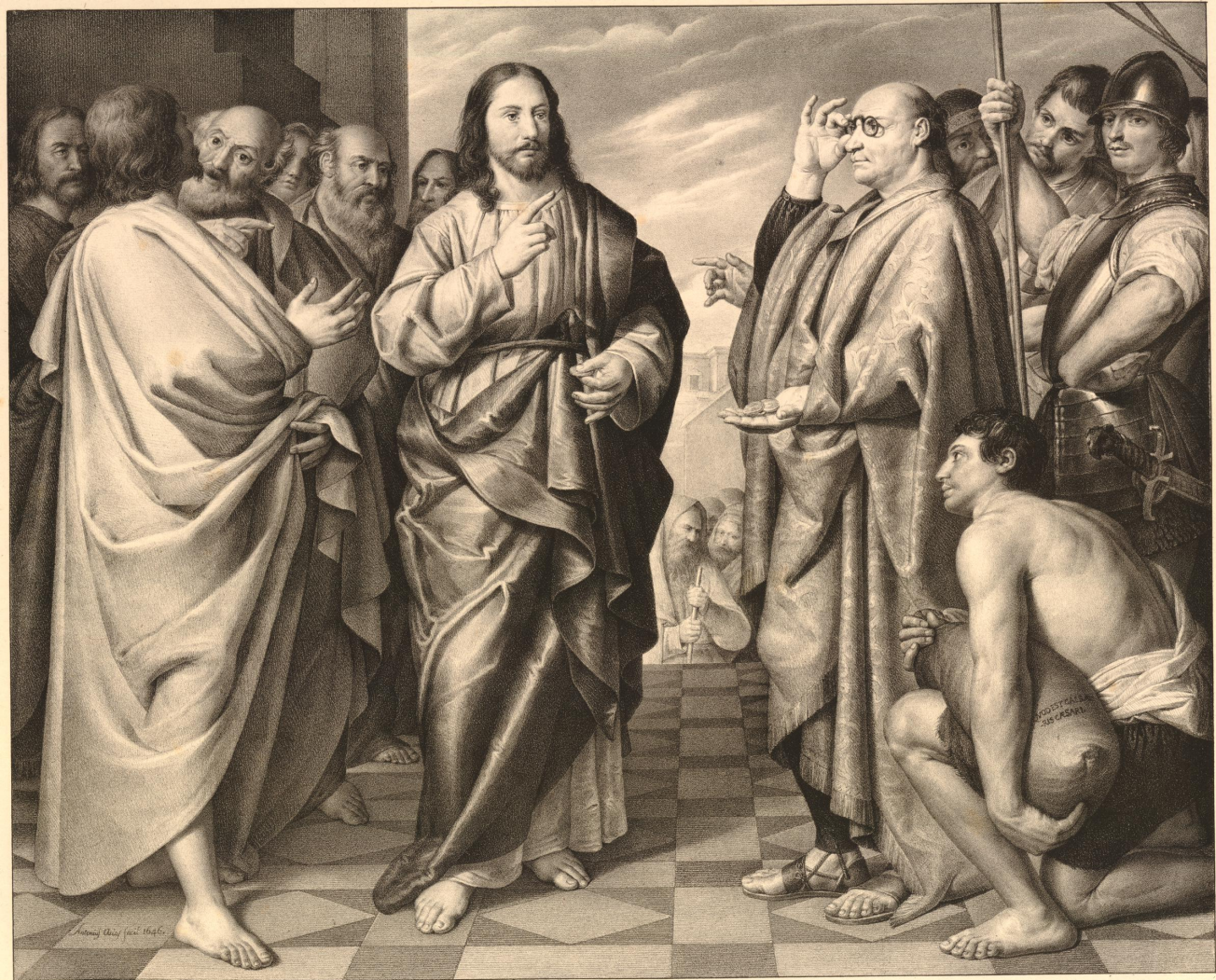
JESUS Y LOS FARISEOS.

El cuadro original existe en el Museo de Madrid.