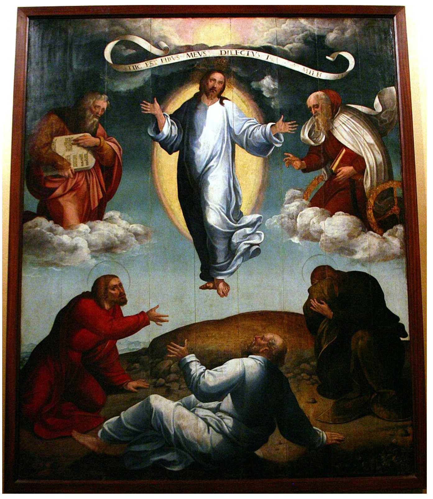
Transfiguration of Jesus Christ by Garcia Fernandes found on <a href="Wikipedia"><u>Wikipedia</u></a>