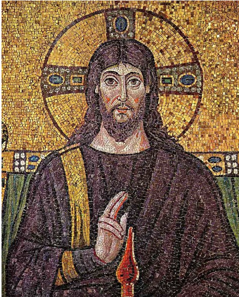
Mosaic of the Ravenna Italo-Bizina school, completed in 526.

Can you believe it? Jesus, the Son of God, with all the power of the universe at his disposal, gave it all up to join us humans in our suffering, our guilt, our deceptions, and especially, our deaths.