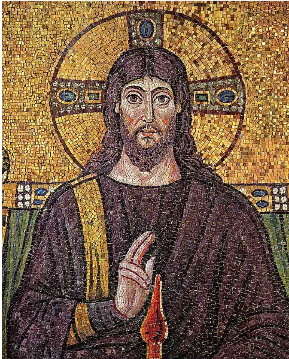
Mosaic of the Ravenna Italo-Bizantine school, completed in 526.

Can you believe it? Jesus, the Son of God, with all the power of the universe at his disposal, gave it all up to join us humans in our suffering, our guilt, our deceptions, and especially, our deaths.