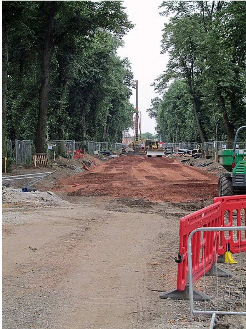
Queen's Walk, preparing the way for the trams

“The one more powerful arrives as a helpless baby... There is the power of God.”