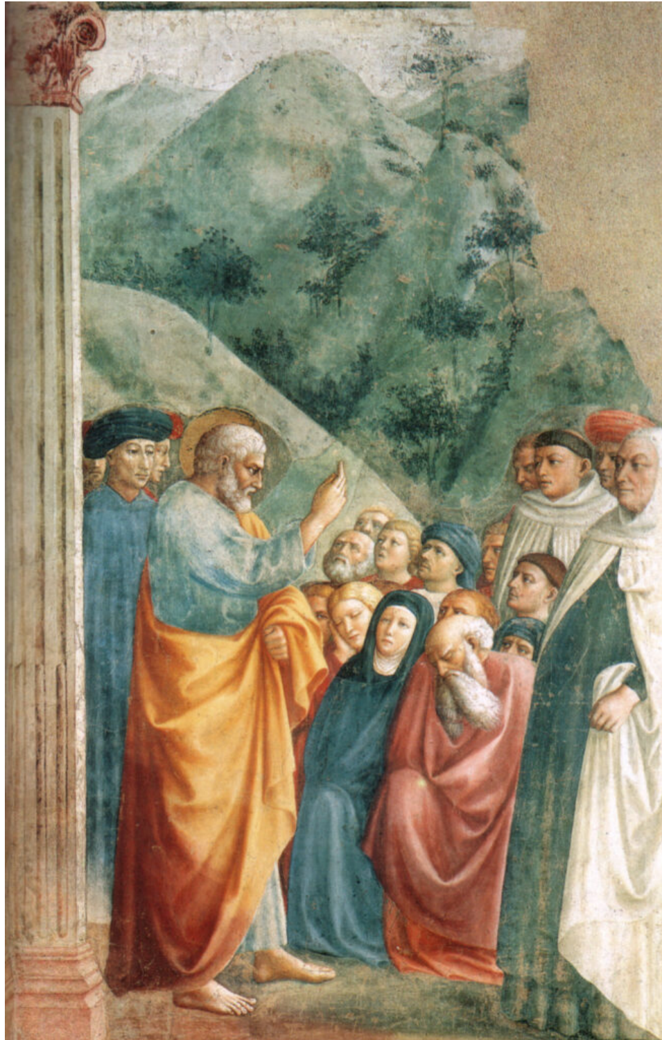
St Peter Preaching – Masolino da Panicale (1383–1447)

The Jerusalem church's radical stewardship and benevolence expressed their newfound freedom in relationship to the risen Christ.