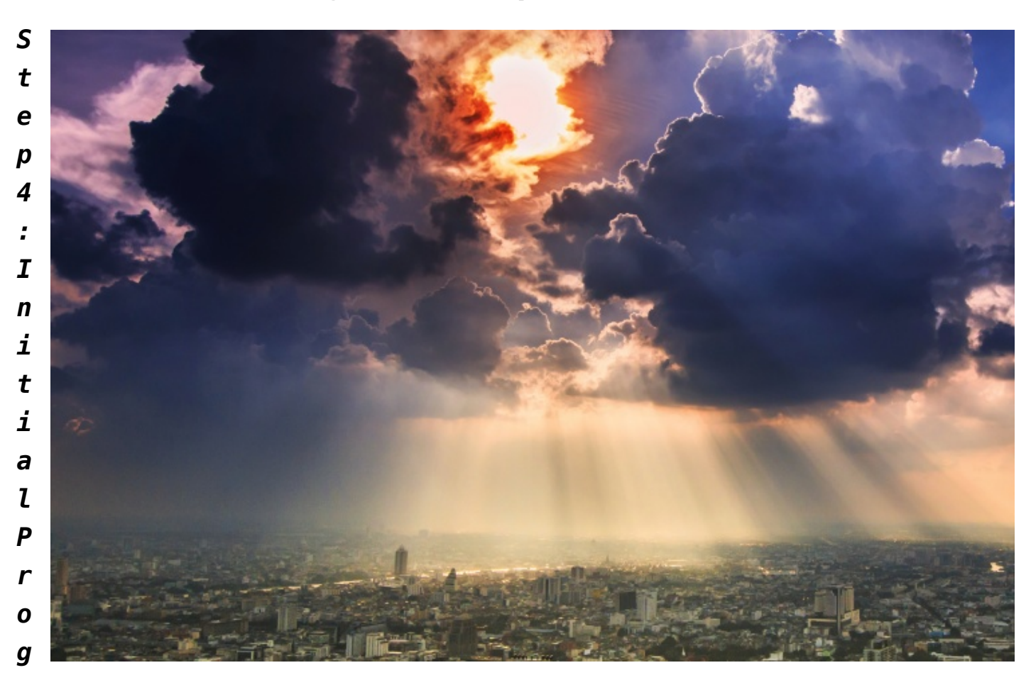
nosis (Eternal Solution): God's Final Word