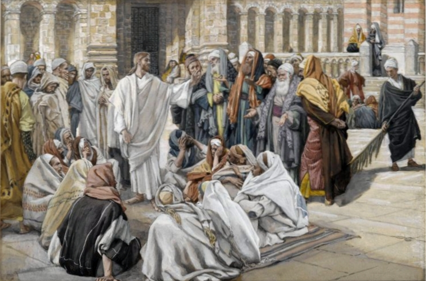
The Pharisees Question Jesus – James Tissot

prostitutes are going into the kingdom of God ahead of you. 32 For John came to you in the way of righteousness and you did not believe him, but the tax collectors and the prostitutes believed him; and even after you saw it, you did not change your minds and believe him.