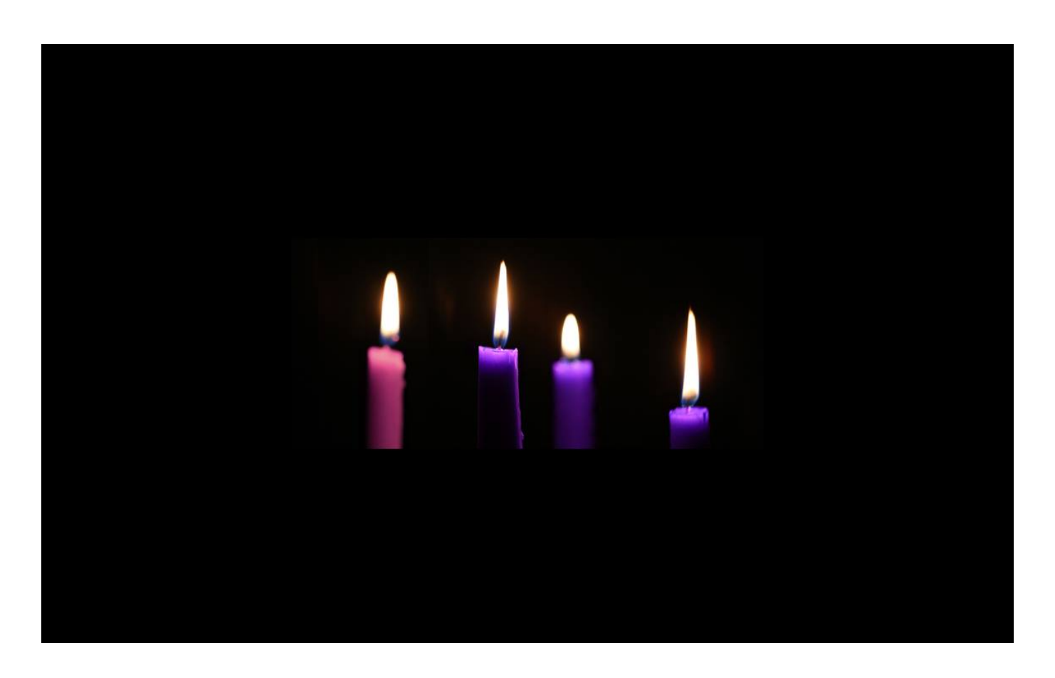
Step 4: Initial Prognosis (Eternal Solution): My Lord, What a Mornin'!

My Lord, what a mornin'! It's true: the stars have begun to fall from the sky, the sun is dark in the middle of the day, the moon gives no light, and the powers in the heavens are shaken. And yet, in the midst of that darkest day comes a loud voice, "Eloi, Eloi, lema sabachthani?" which means, "My God, my God, why have you forsaken me?" But that's not all. The temple curtain is torn in two, from top to bottom, and one who witnesses this utters an awe-filled prayer to himself, "Truly, this man was God's Son." Jesus has returned "with great power and glory," but it is not the glory we expected; it is the glory of the Cross. It is the world-turned-upside-down kind of glory where the meek, the mourning, the poor in spirit and those longing for justice are called blessed.