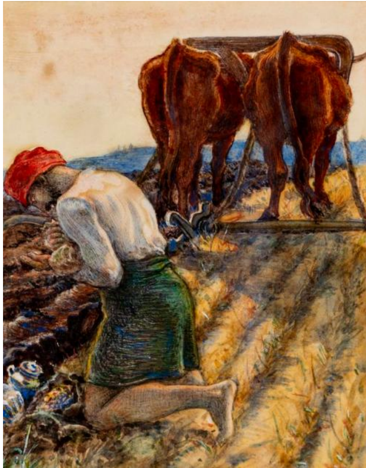
Parable – The Hidden Treasure – Sir John Everett Millais

51Have you understood all this? They answered, "Yes." 52And he said to them, "Therefore every scribe who has been trained for the kingdom of heaven is like the master of a household who brings out of his treasure what is new and what is old."