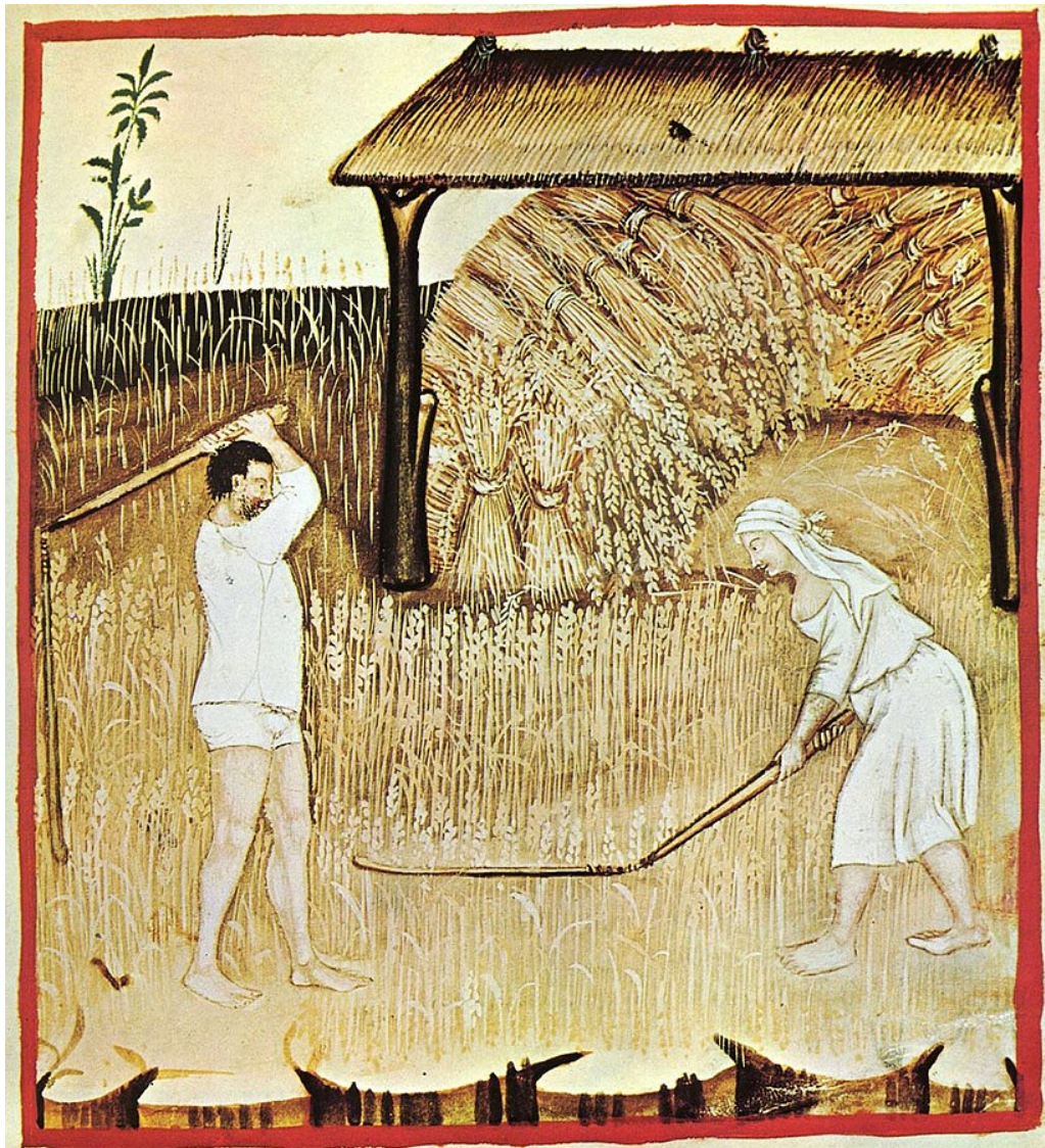
Tacuina sanitatis (14th century)

with fire, so will it be at the end of the age. 41 The Son of Man will send his angels, and they will collect out of his kingdom all causes of sin and all evildoers, 42 and they will throw them into the furnace of fire, where there will be weeping and gnashing of teeth. 43 Then the righteous will shine like the sun in the kingdom of their Father. Let anyone with ears listen!