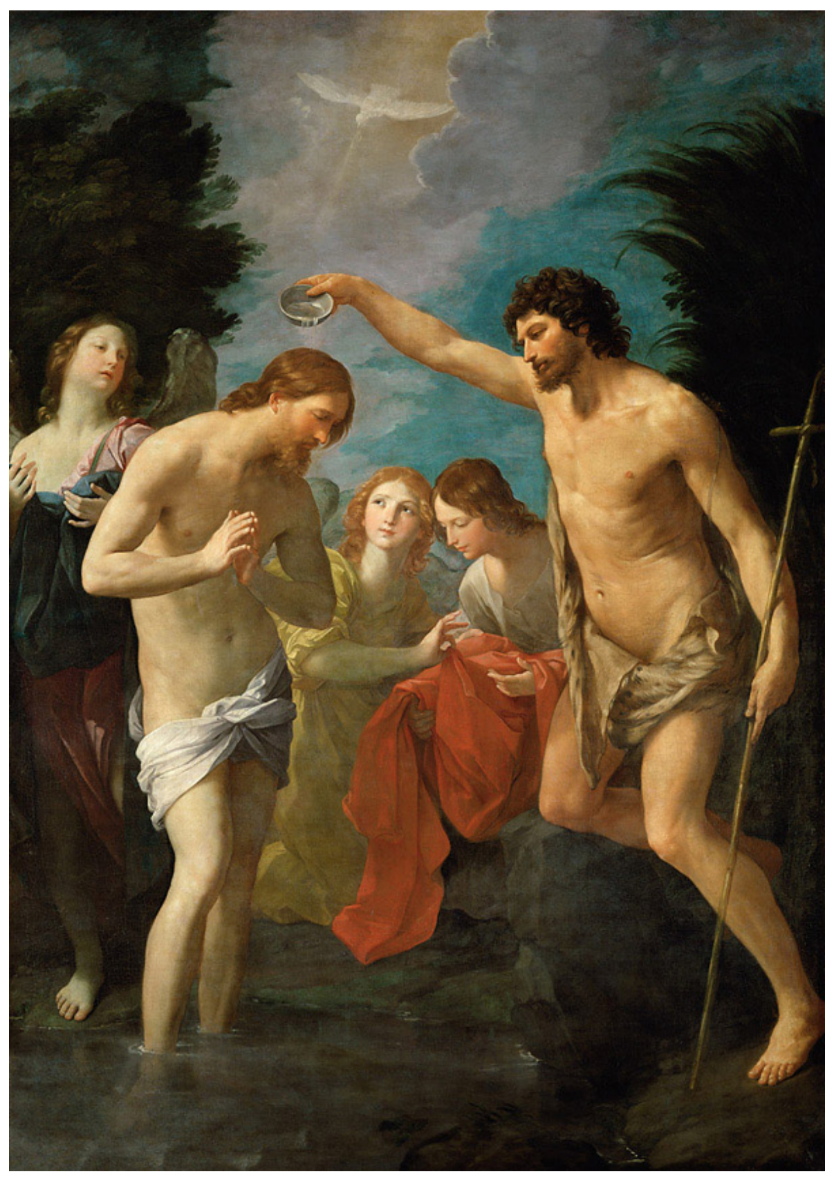
Guido Reni — Baptism of Christ (Kunsthistorisches Museum)