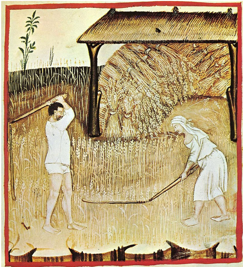
Tacuina sanitatis (14th century)

with fire, so will it be at the end of the age. 41 The Son of Man will send his angels, and they will collect out of his kingdom all causes of sin and all evildoers, 42 and they will throw them into the furnace of fire, where there will be weeping and gnashing of teeth. 43 Then the righteous will shine like the sun in the kingdom of their Father. Let anyone with ears listen!