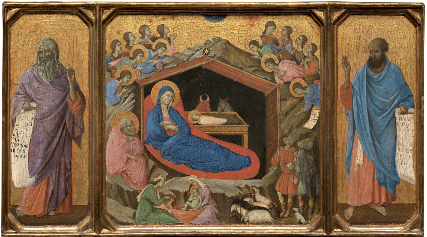
Duccio di Buoninsegna: The Nativity with the Prophets Isaiah and Ezekiel, 1308-1311

him Immanuel. 15 He shall eat curds and honey by the time he knows how to refuse the evil and choose the good. 16 For before the child knows how to refuse the evil and choose the good, the land before whose two kings you are in dread will be deserted.