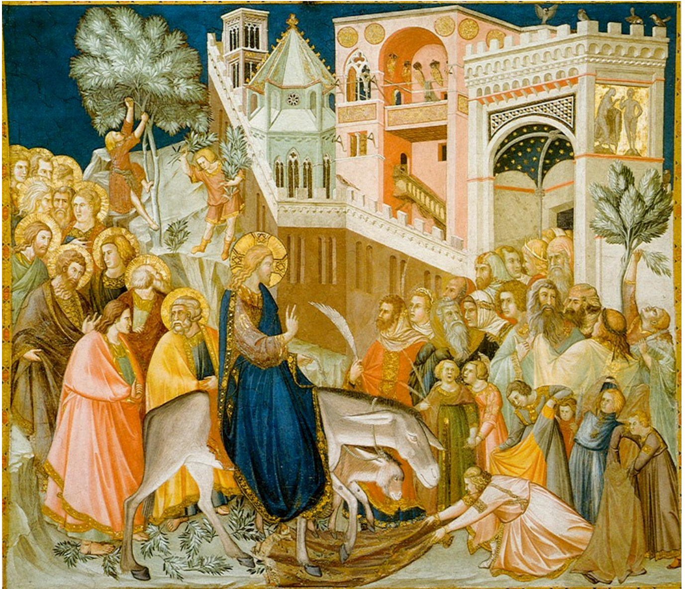
Entry of Christ into Jerusalem (1320) by Pietro Lorenzetti- Source, Public Domain, https://commons.wikimedia.org/w/index.php?curid=3944840

Jesus embraces the vulnerability of being human for us; a divine act only God could accomplish.