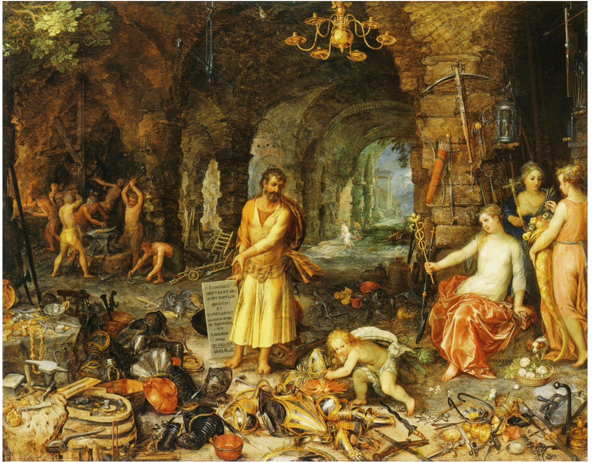
Jan Brueghel the Elder, The Prophecy of Isaiah, oil painting (Alte Pinakothek – Bayerische Staatsgemaldesammlungen)

7the burning sand shall become a pool, and the thirsty ground springs of water; the haunt of jackals shall become a swamp, the grass shall become reeds and rushes.