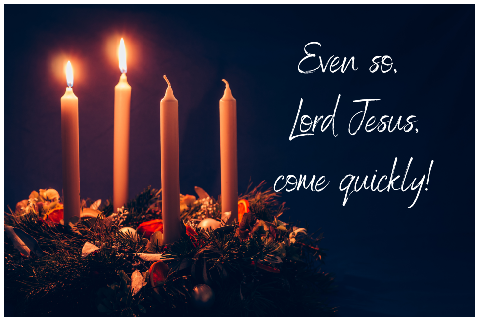
Advent 2 (from Canva)

Step 6: Final Prognosis (External Solution): Come Quickly, Lord Jesus!