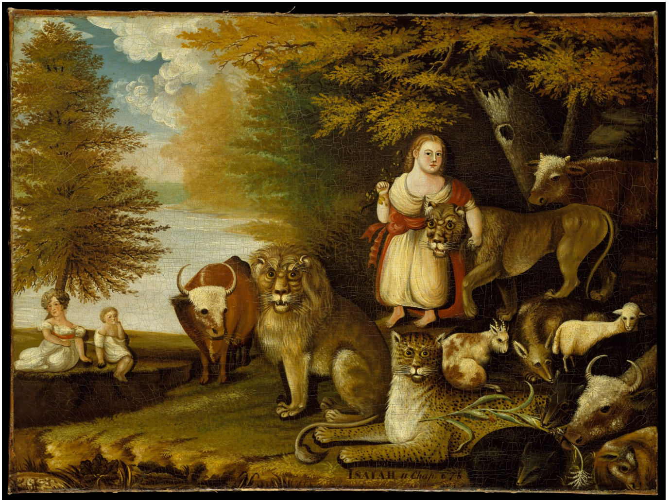
Peaceable Kingdom, by Edward Hicks, ca. 1830–32 (The Met Fifth Avenue)

“Hezekiah 6:1,” a passage you won’t find in your Bible). God’s promises seem too far-fetched—the height of magical thinking. After all, it’s absurd to imagine the wolf living with the lamb and the leopard lying down with the kid. Nature doesn’t work that way. Carnivores would starve and die. In other words, it is naive to think such reckless redemption could ever be possible in a world like this. So, we abandon God’s promises. Left to our predator-prey world, someone will die.