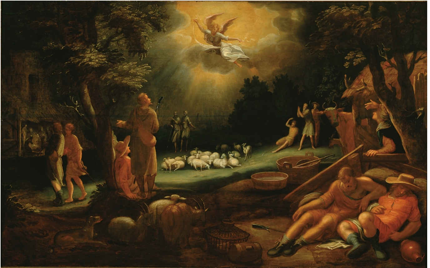
Announcement to the Shepherds, Manner of Abraham Bloemaert, c1600

Better than bearing our sin, Jesus comes to bear our death. He defeats death as he comes newborn from the grave. He leaves our sins in the tomb.