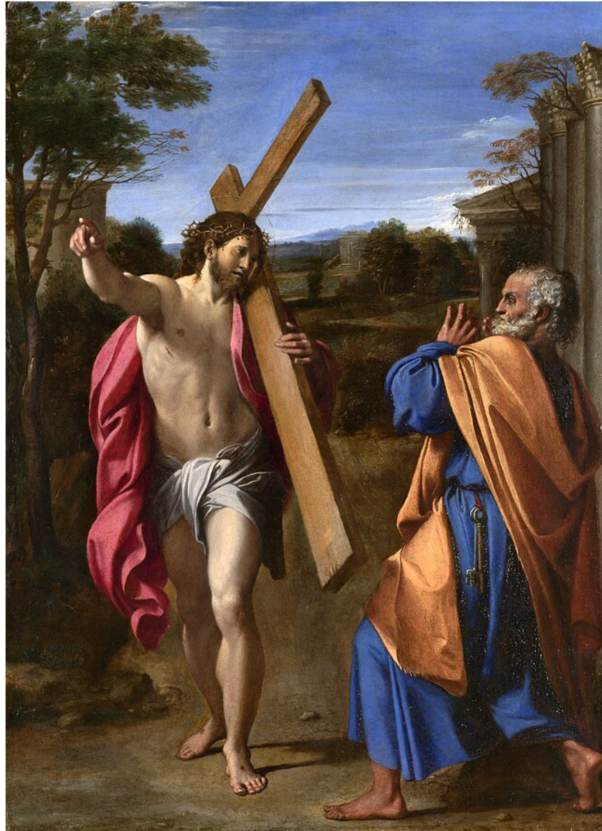
Domine, Quo Vadis – Annibale Carracci

Christ denies himself, takes up the Cross, loses his life, forfeits his life, all that we might gain our life.