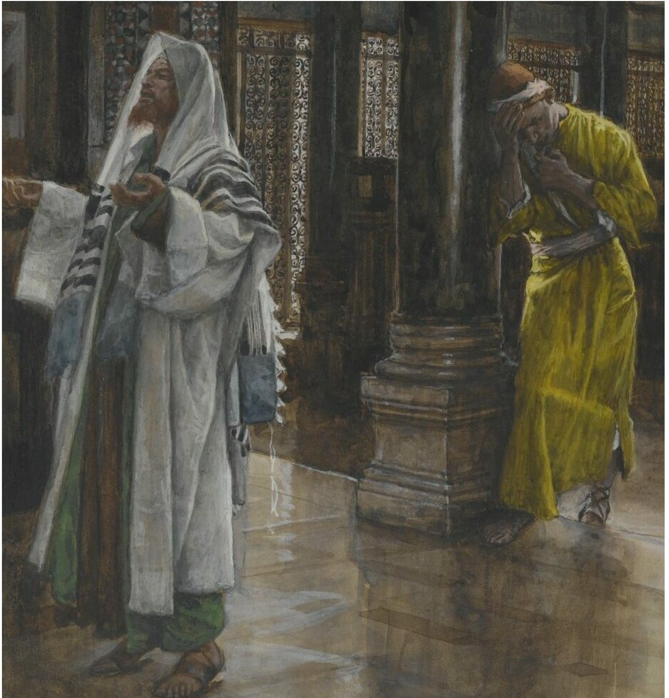
James Tissot (French, 1836-1902). The Pharisee and the Publican (Le pharisien et le publicain), 1886-1894, cropped. Opaque watercolor over graphite on gray wove paper, Image: 9 7/8 x 6 1/2 in. (25.1 x 16.5 cm). Brooklyn Museum, Purchased by public subscription, 00.159.178

Our expectations, our stereotypes, and all our notions of “who