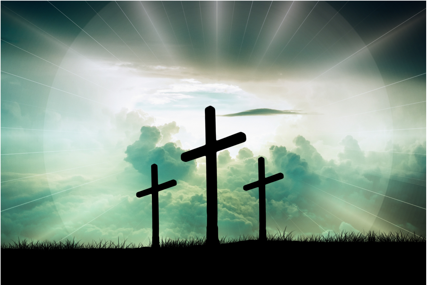
Three Crosses

Despite evidence to the contrary, flying in the face of everyone's expectations, hidden beneath what seems to be anything but royal or godly, Jesus is King.