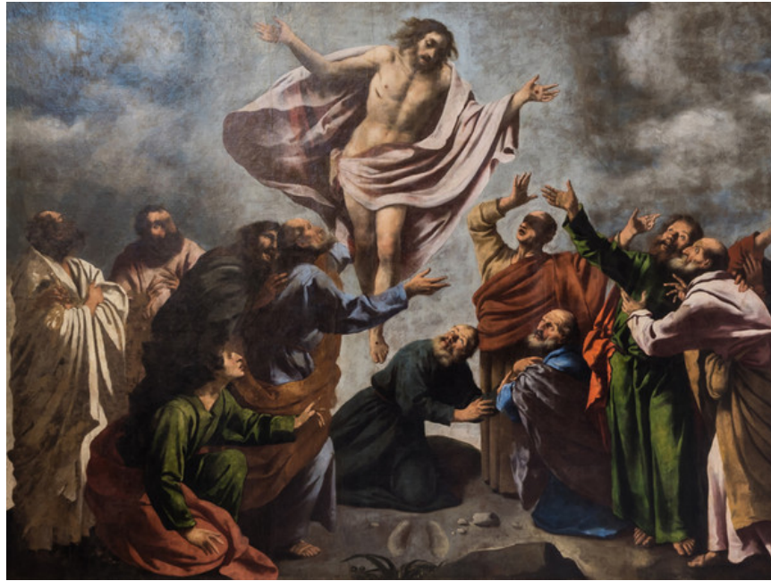
Ascension of Christ – Pietro della Vecchia