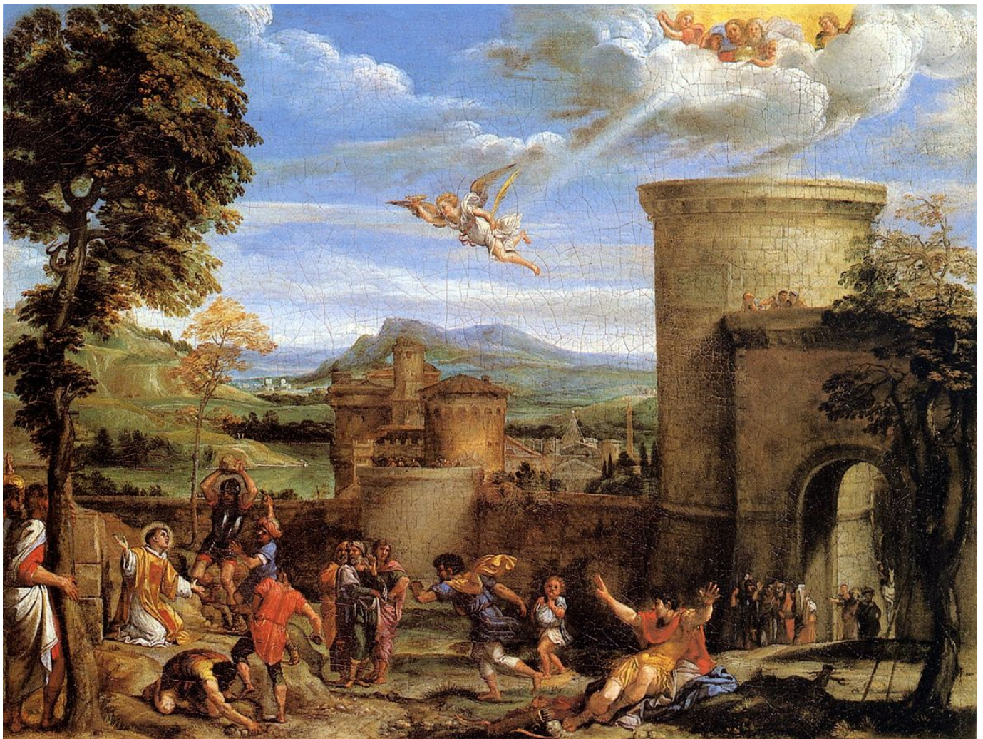
The Martyrdom of St Stephen – Annibale Carracci

55But filled with the Holy Spirit, he gazed into heaven and saw the glory of God and Jesus standing at the right hand of God. 56Look, he said, "I see the heavens opened and the Son of Man standing at the right hand of God!" 57But they covered their ears, and with a loud shout all rushed together against him. 58Then they dragged him out of the city and began to stone him; and the witnesses laid their coats at the feet of a young man named Saul. 59While they were stoning Stephen, he prayed, "Lord Jesus, receive my spirit." 60Then he knelt down and cried out in a loud voice, "Lord, do not hold this sin against them." When he had said this, he died.