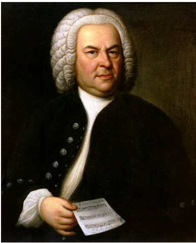
Johann_Sebastian_Bach, by Elias Gottlob Haussmann