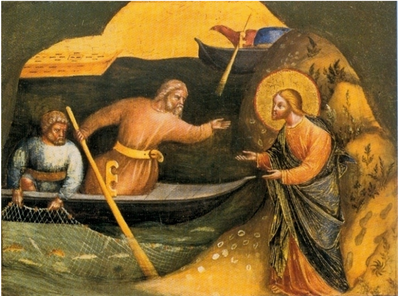
Lorenzo Veneziano, Calling of the Apostles Peter and Andrew. 1370

and proclaiming the good news of the kingdom and curing every disease and every sickness among the people.