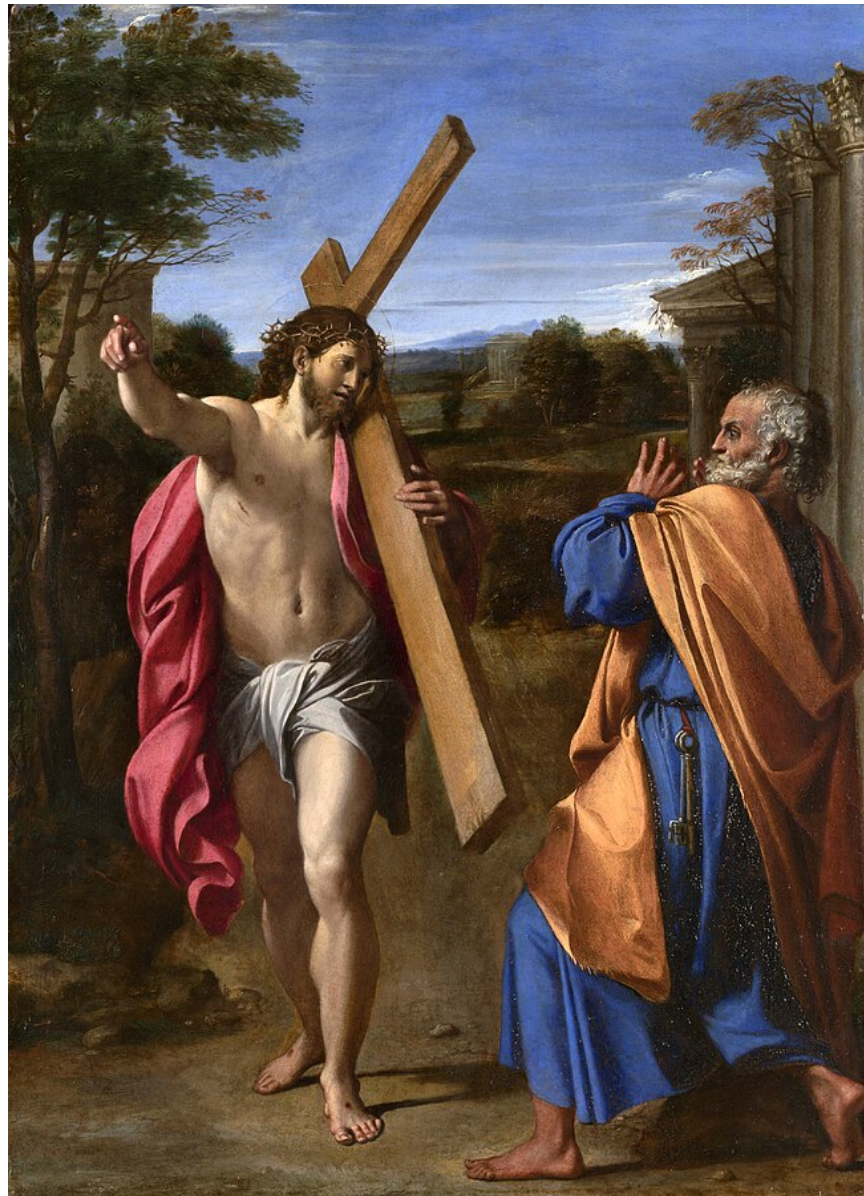
Domine, Quo Vadis – Annibale Carracci

Christ denies himself, takes up the Cross, loses his life, forfeits his life, all that we might gain our life.