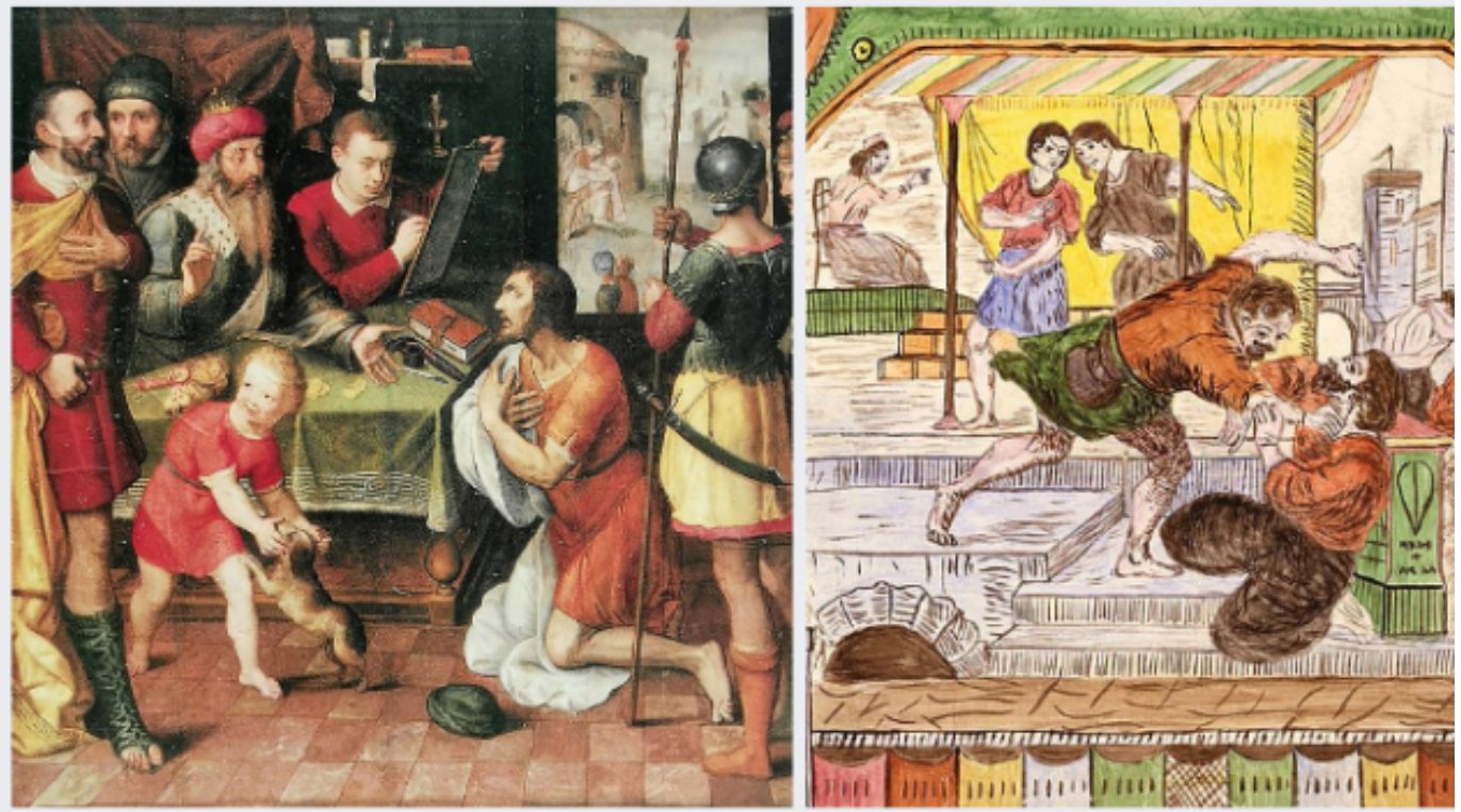
(Right) The Unmerciful Servant/Just Judge

all that debt because you pleaded with me. 33Should you not have had mercy on your fellow slave, as I had mercy on you?’ 34And in anger his lord handed him over to be tortured until he would pay his entire debt. 35So my heavenly Father will also do to every one of you, if you do not forgive your brother or sister from your heart.”