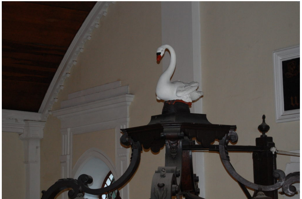
Swan in Pulpit

22. Those who do not believe, but seek refuge in human help, will fall and succumb to death.