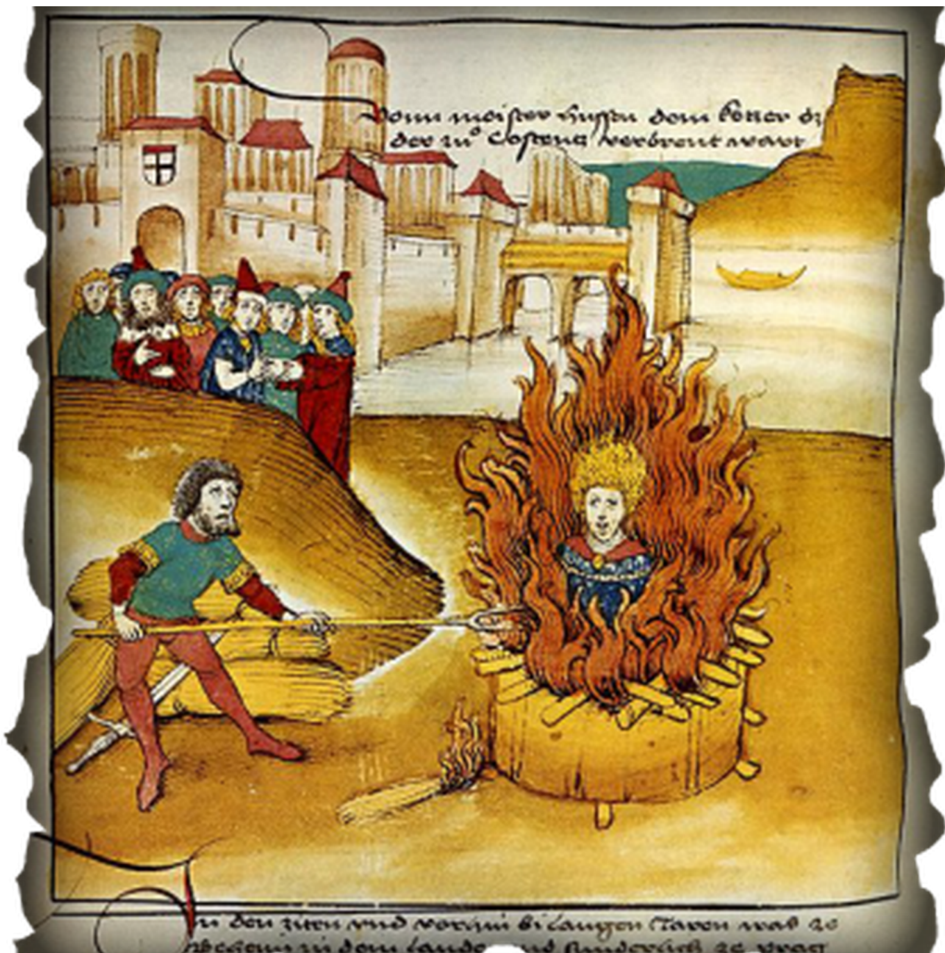
The Death of Jan Hus