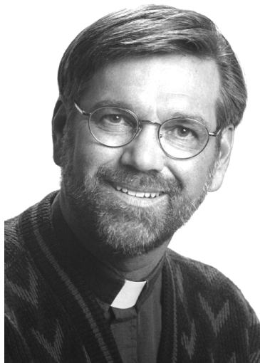
Conference keynote speaker: very kuhl!

The Divorce of Sex and Marriage: Sain Sex